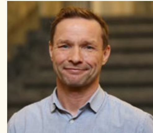
Andreas Keil Mayor of Employment, Integration, and Business