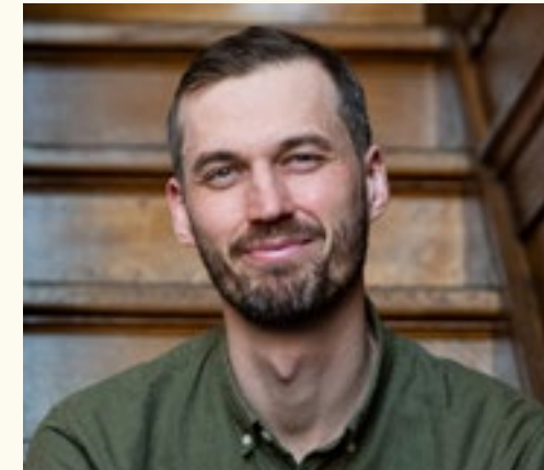
Christopher Røhl Mayor of Culture, Leisure, and Citizen Services